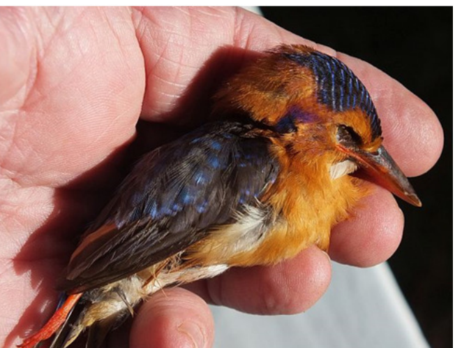
Grey-headed Kingfisher at Mana ( left,) and African Pygmy-kingfisher at Mandara ( above,)