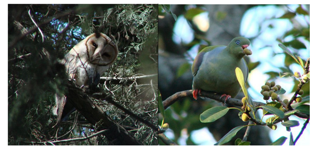
Barn Owl and African Greenpigeon at Mandara, James Ball

Contributions for The Babbler 132 October-November 2016 may be sent to the editor anytime between now and the very latest 14<sup>th</sup> September 2016.