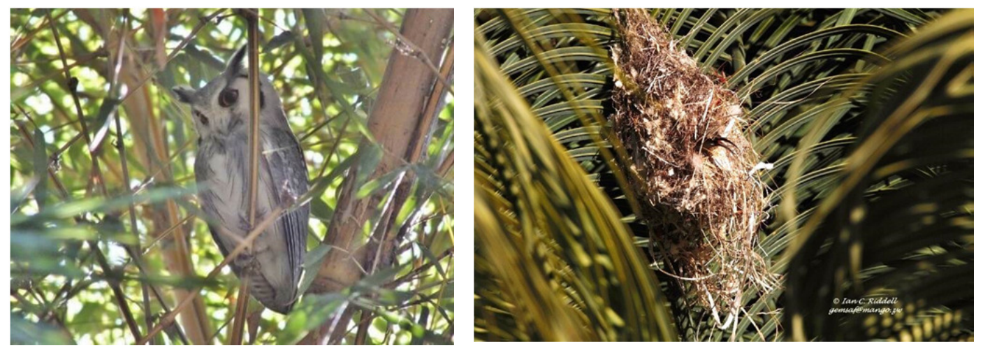
Southern White-faced Scops-owl in Mandara, 21 June (James Ball) and Miombo Double-collared Sunbird nesting in a cycad in a Newlands Garden in July 2016 (Ian Riddell) What have you found in your garden?